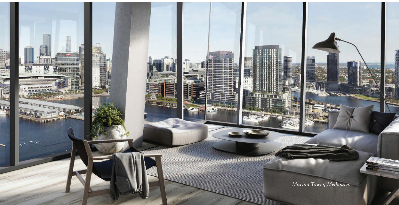
Marina Tower, Melbourne

During the year, Hiap Hoe entered into a sale and purchase agreement to acquire a hotel and a commercial office building in Western Australia.