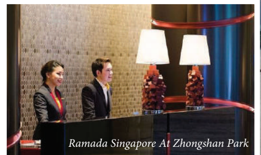
Ramada Singapore At Zhongshan Park